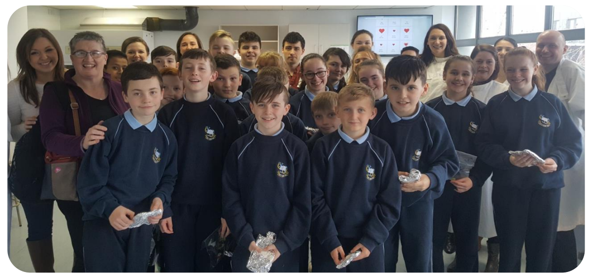
TTMI TAP Science Workshop

In April we met Ms. O'Connor-Maguire's wonderful 5<sup>th</sup> class from City Quay National School. We ran a 2hour workshop onsite with 6 different activities for the students to try. Before the workshop we asked if anyone in the group wanted to be a scientist when they were older....no hands were raised! We had our work cut out for us to get them interested in what we do!